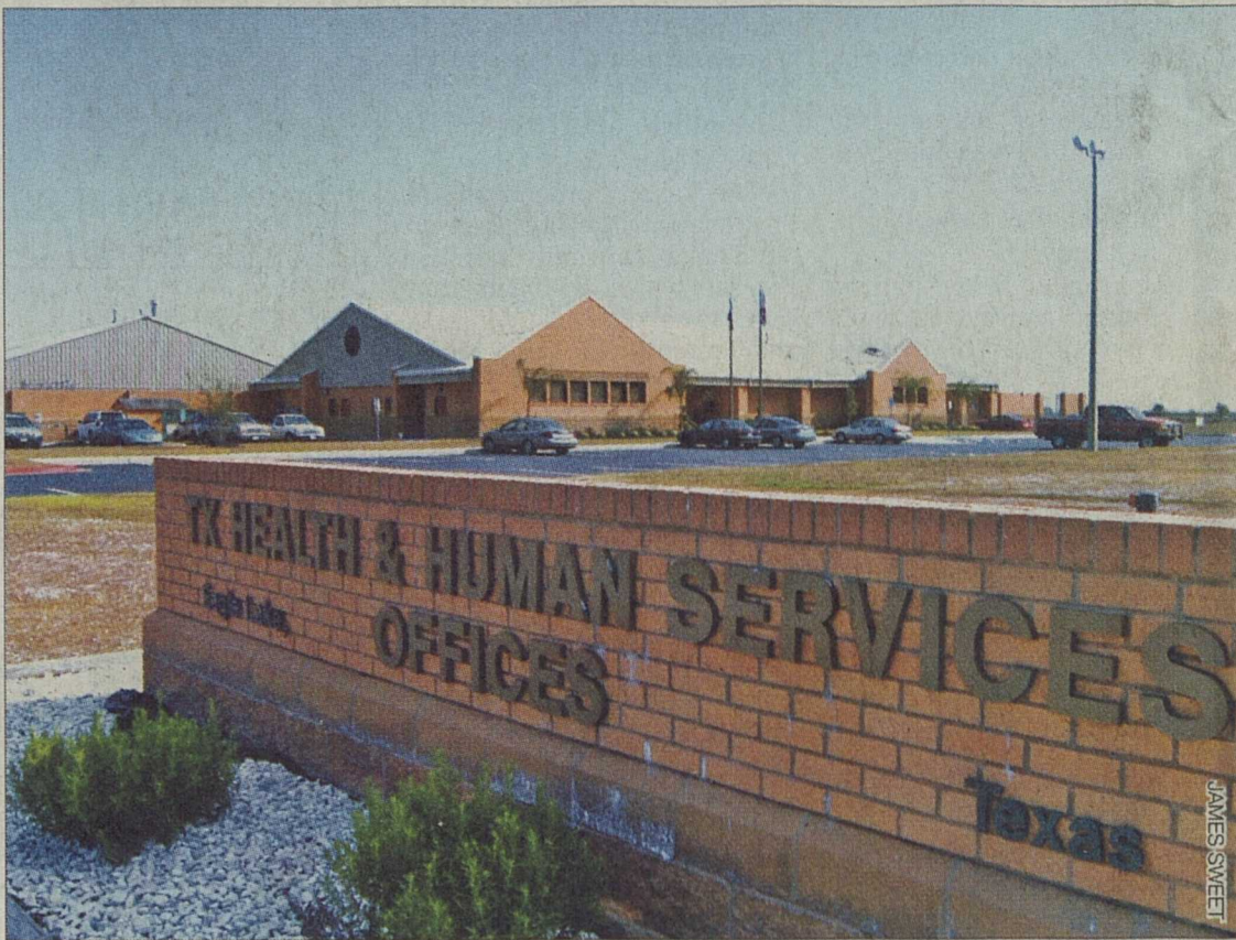
The Eagle Lake Residential Treatment Facility closed on October 23 before it ever really even opened. The sign out front was never even changed from when a portion of the facility housed Health and Human Services Offices prior to the new contract to once again house juveniles.