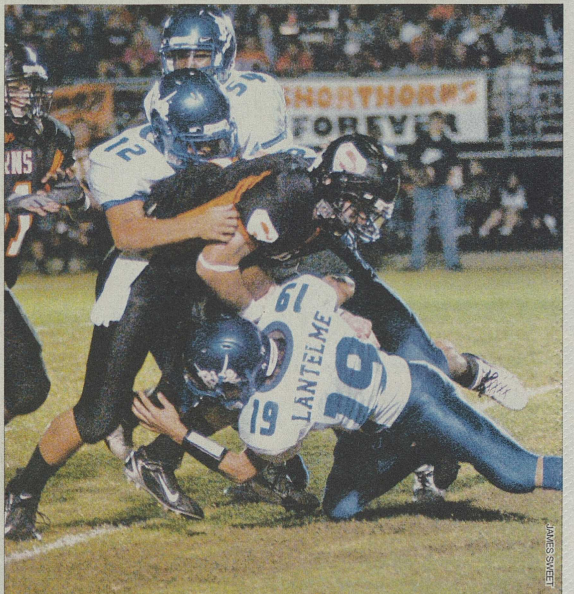
The Rice Raiders defeated Schulenburg 42-14 last Friday to move to 7-0 on the season. This win also clinched a spot in the Division 1-AA Playoffs. The first playoff game will be Nov. 14 at 7:30 in Seguin against Salado. See page B1 for story on the Schulenburg game. Rice has two more regular season games. This week they host Hempstead for Homecoming on Halloween night.